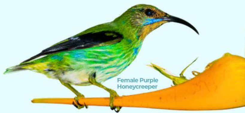
Female Purple Honeycreeper